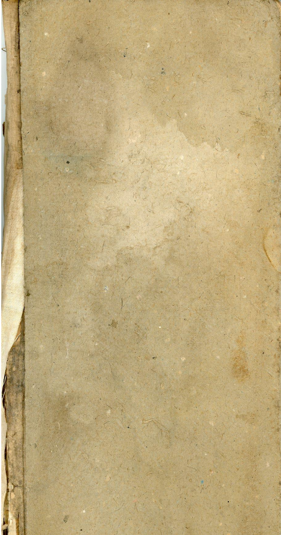
Alma Business Account book from early 1900's