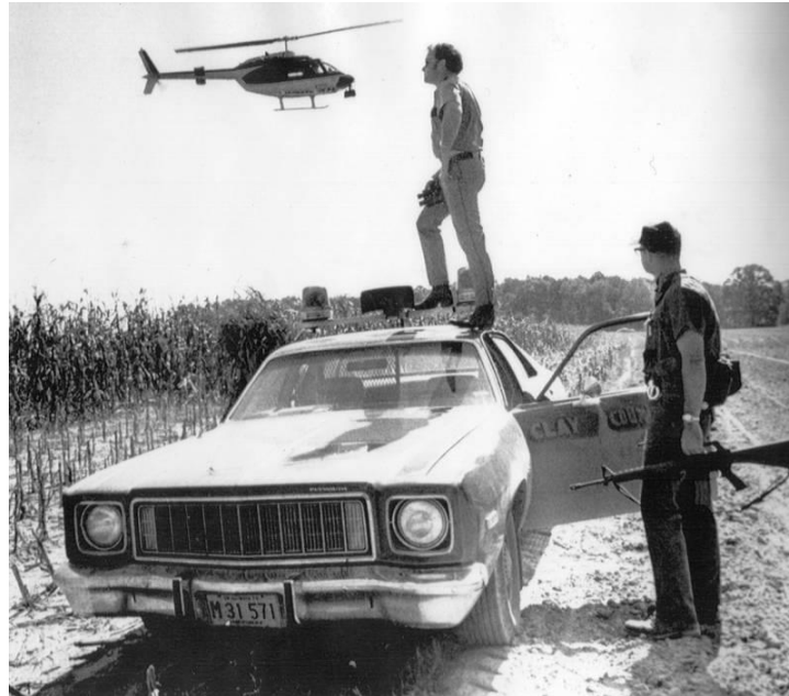
The Marion fugitives were hunted via the air and by every area police force including, as seen here, Clay County's.